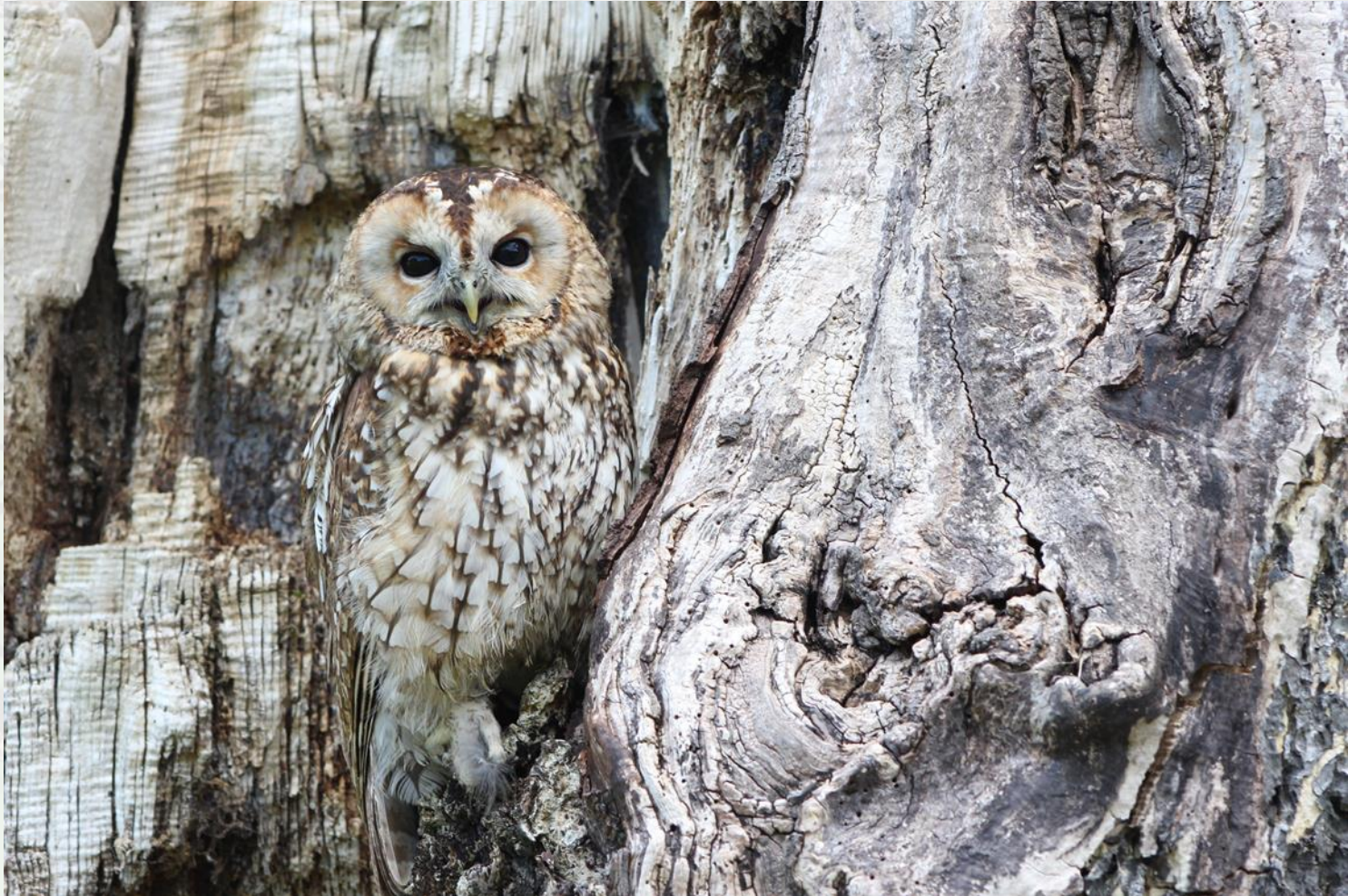
Photo courtesy of (@flickr.com) - granted under creative commons licence – attribution