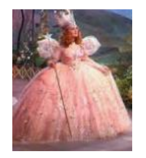
Good witch of the North