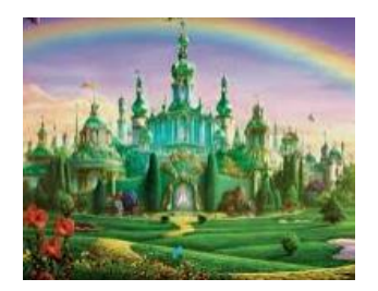
City of Oz