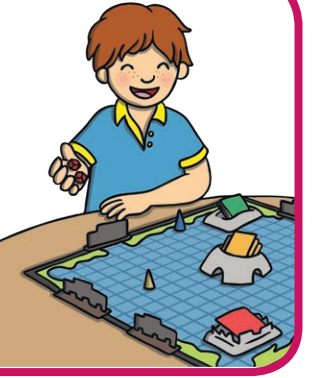
Is this fair? Yes or No

2. A girl is told off for talking but it wasn't her.