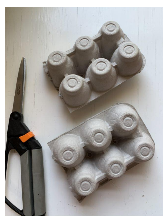
STEP 2: PAINTING THE ALLIGATOR PARTS

Paint your three egg carton pieces (the back, head, and mouth)