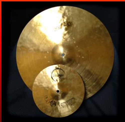
Eve Batten 7.2.08

Outside they play really loud music and let off firecrackers (a kind of firework) that make a really loud noise.