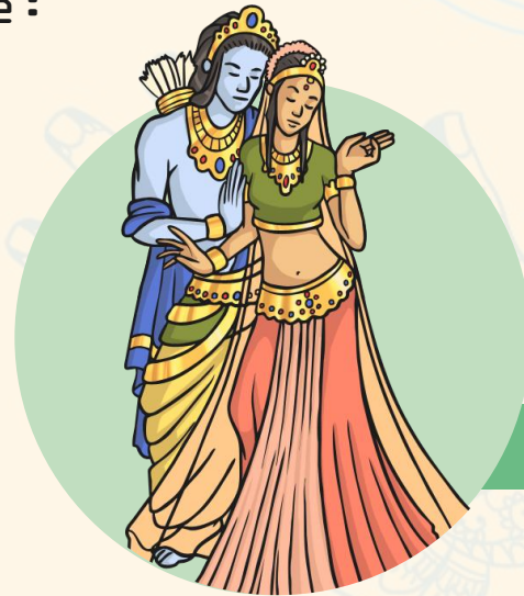
Rama and Sita