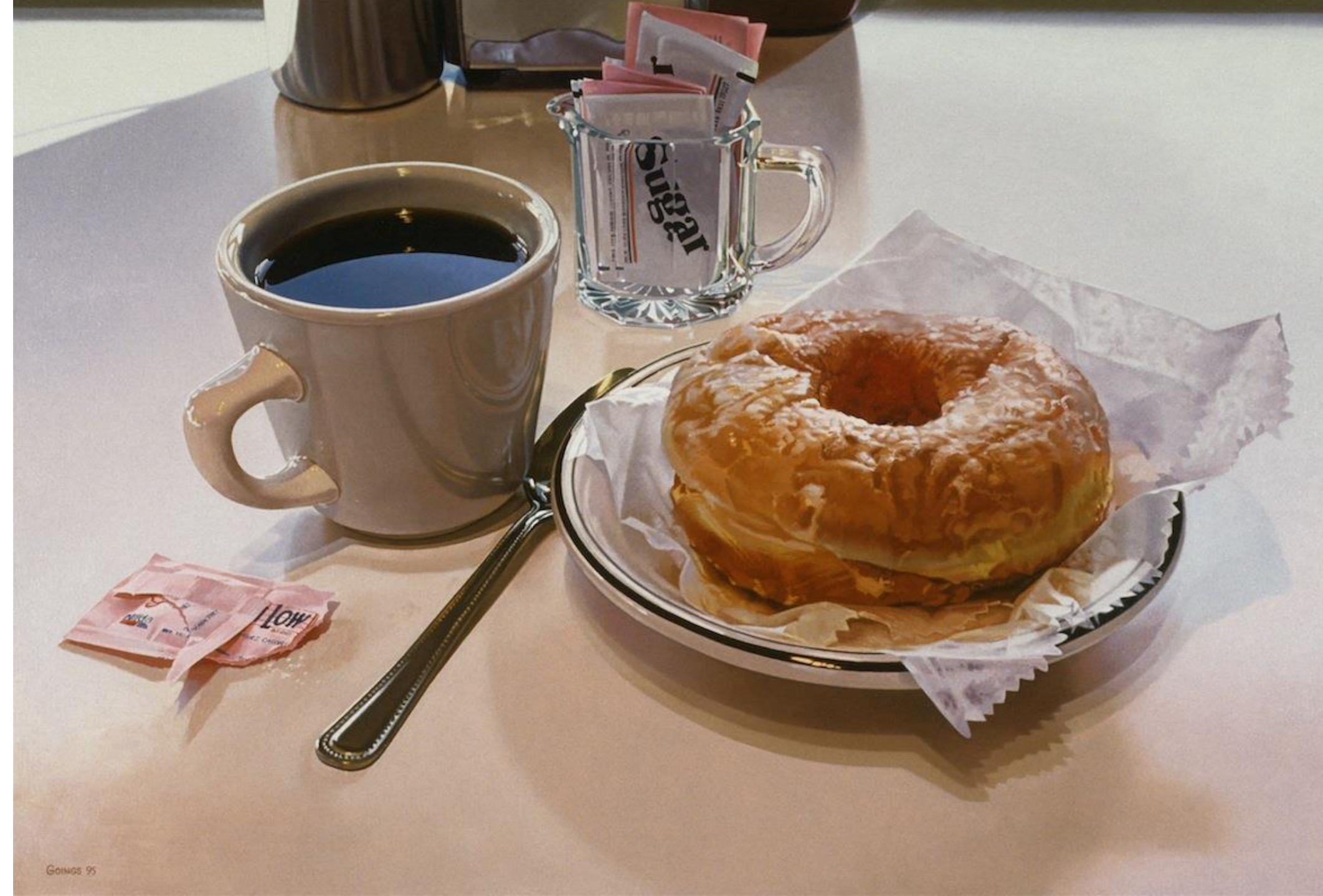
Donut' 1995 Oil painting Ralph Goings