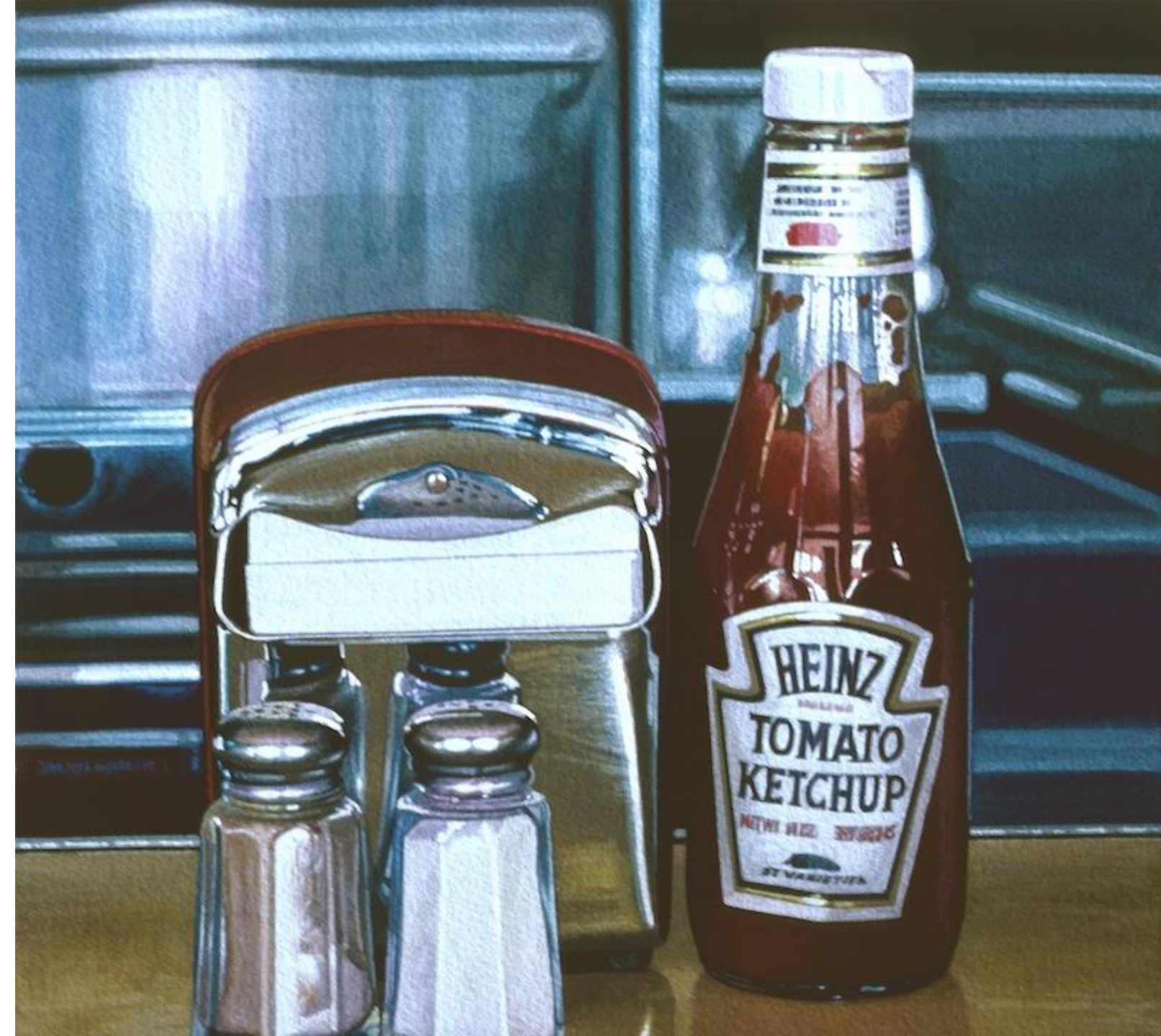
'Red Napkin Holder' 1971 Watercolour Ralph Goings