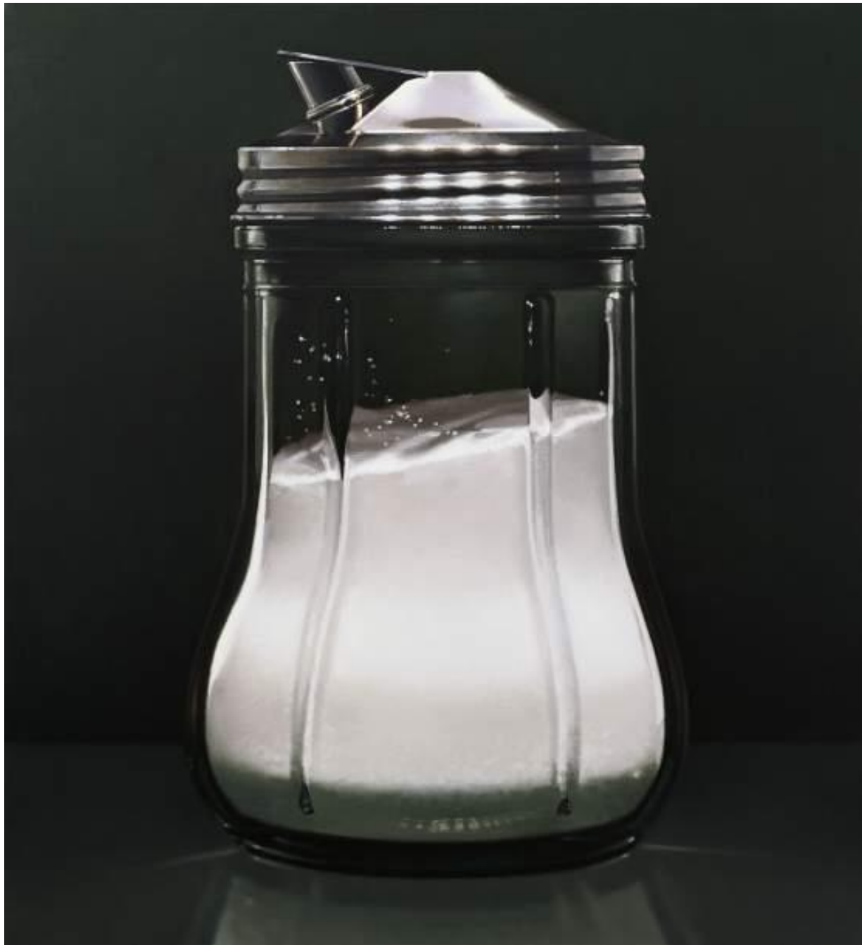
'Sugar Shaker' 2006 Ralph Goings