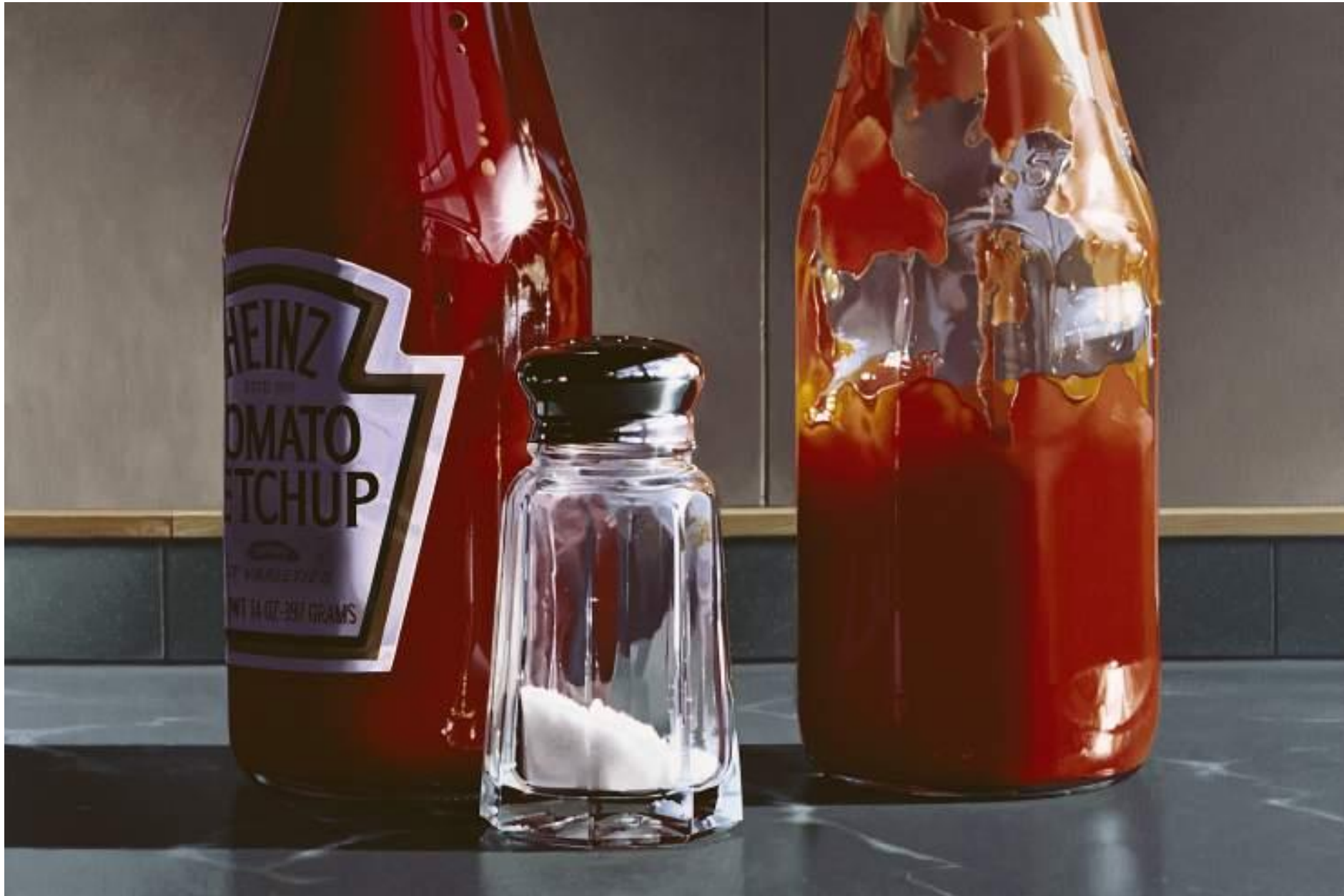
'Double Ketchup' 2006 Ralph Goings