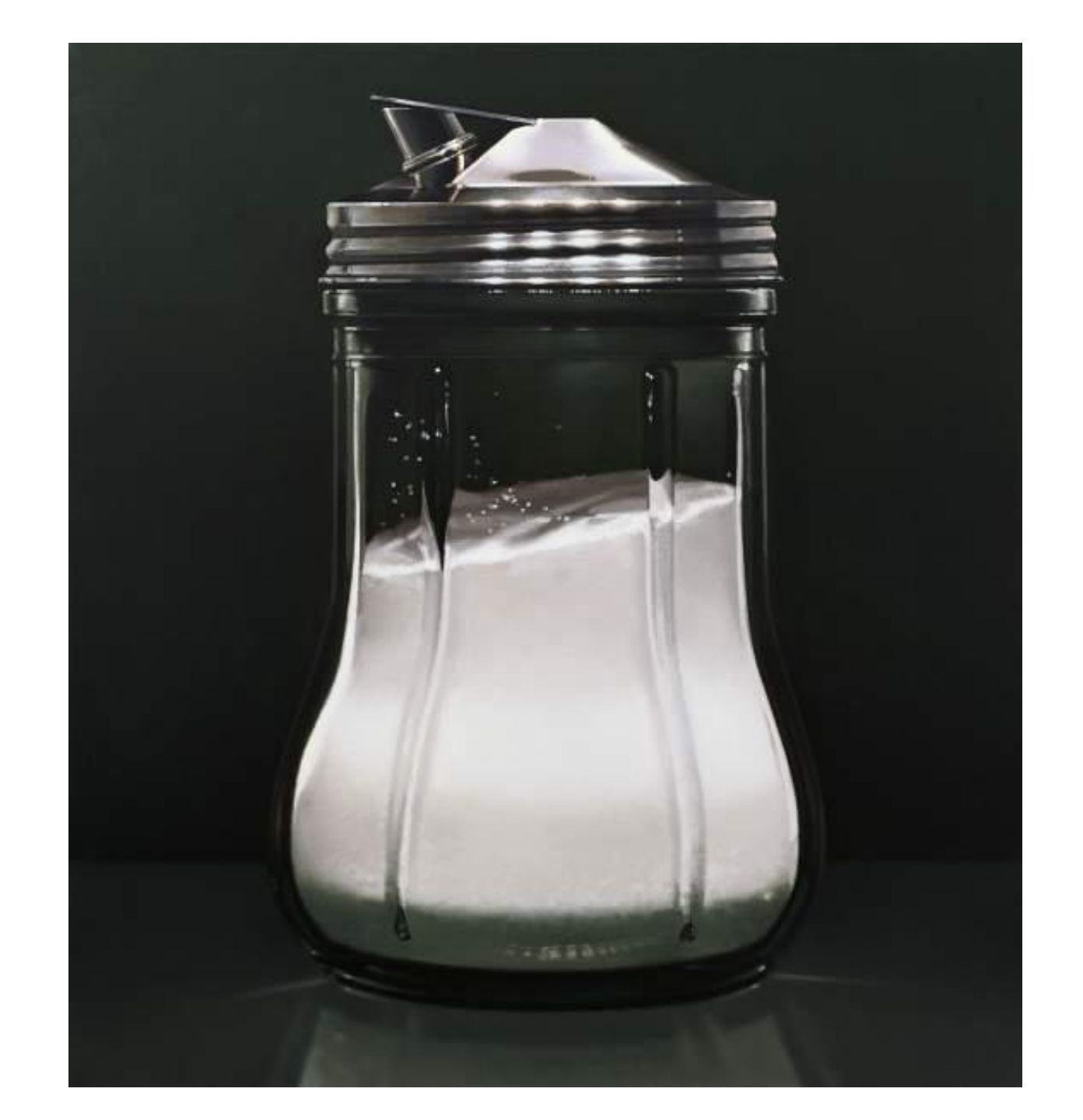
'Sugar Shaker' 2006 Ralph Goings