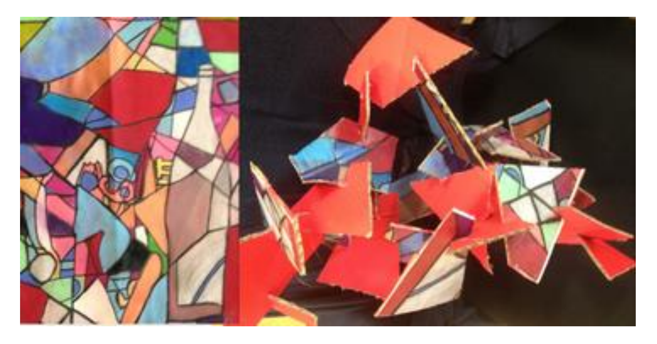
Example of a still life drawing made into a 3D model, inspired by Picasso.